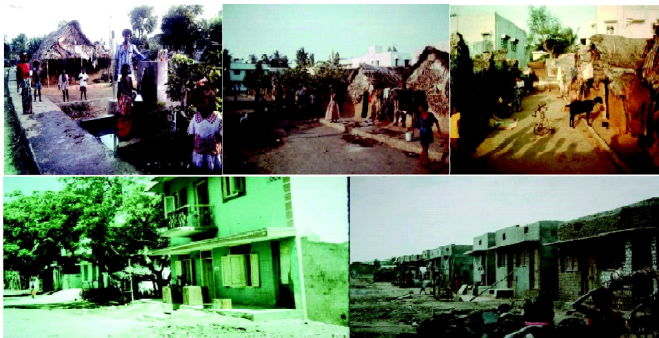
Figure 1: Formerly Chennai

In 1746, the French under General La Bourdonnais, Governor of Mauritius, captured Fort St. George and Madras, plundering the city and nearby villages. By the Treaty of Aix-la-Chapelle in 1749 control passed back into British hands. They fortified the city wall to ward off French and other threats from Mysore Sultan Hyder Ali. Along with Tamil Nadu, the other northern modern states of Andhra Pradesh and Karnataka were conquered by the British in the late 18th century. It was during this period that the Madras Presidency was established with Madras as its capital. Under British rule, the city grew into a major urban center and naval base. During World War I, the German light cruiser ‘SMS Emden’ attacked an oil depot in Madras. The attack destroyed shipping lanes in the Indian Ocean and disrupted shipping. Madras was the only Indian city to be attacked during World War I. After India gained independence in 1947, Chennai became the capital of Madras State. Madras State was renamed as Tamil Nadu State in 1969. Chennai, the birthplace of the Indian Railways, was also home to the country’s first electric trams in 1895. Unfortunately, politicians ended the service in the early 1950s with the idea of building “modern” roads and bridges for cars. By 1985, Chennai, then known as Madras, had grown its car and motorcycle population to over 200,000. It rose to 600,000 in 1992, 3.6